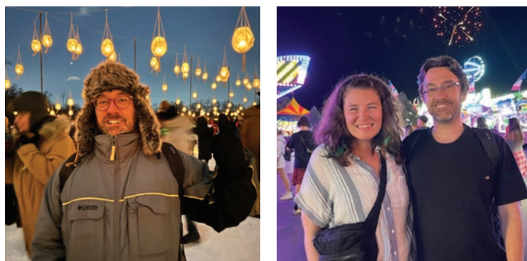
Enjoying local events like winter luminary walks and the State Fair