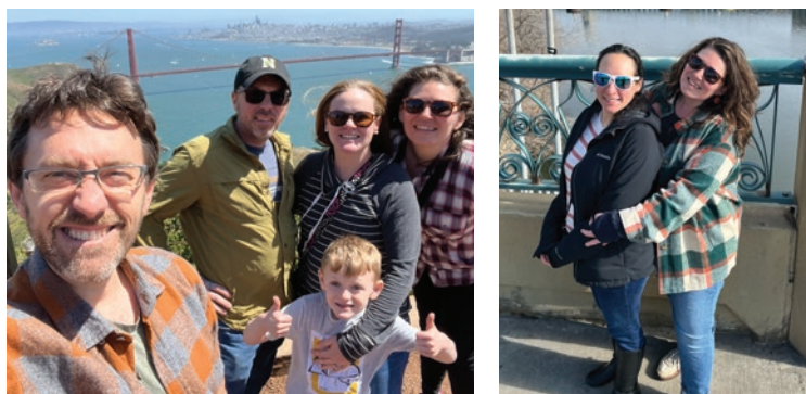
Chosen family: we see our childhood best friends often