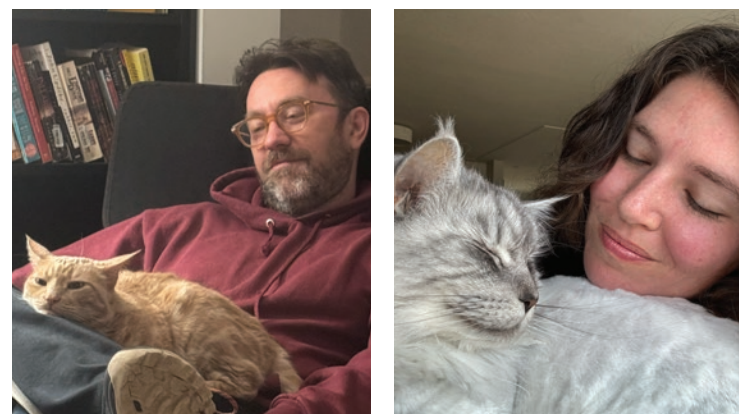
Snuggle time with our cats!