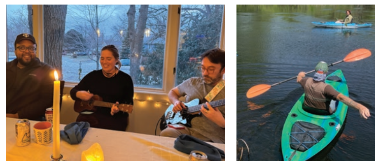
Thanksgiving jam sesh at our table | Kayaking from our dock!