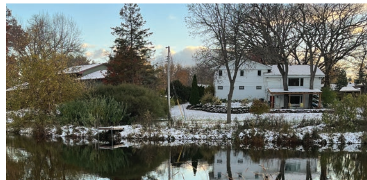
Our home from across the creek