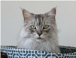
Zuzu Affectionate, loves watching birds