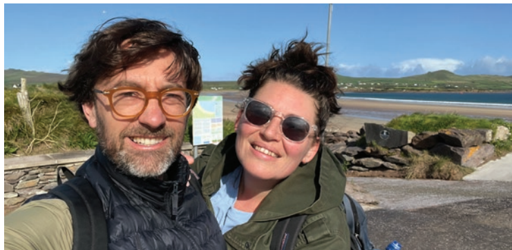
Heading out on a three-day hike on the Ireland coast