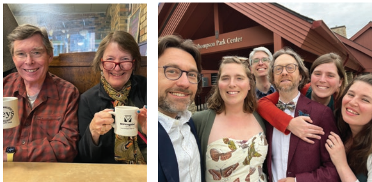
Meg's parents | With Meg's sisters & husbands