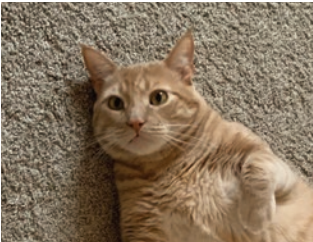
Marty McFluff Snuggly, playful and very silly