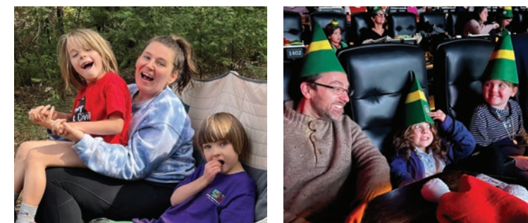
Kid friendly adventures!