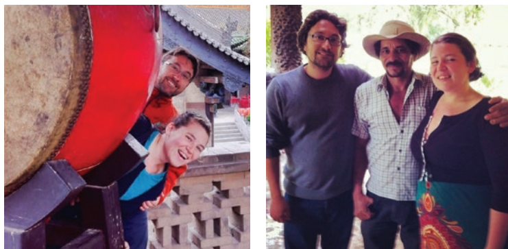
We love to travel — China and Costa Rica were highlights!